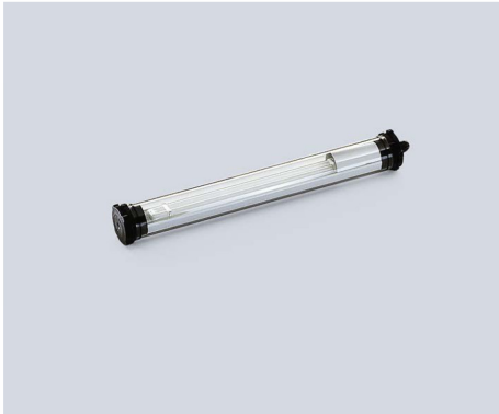
RL70C - 136 S